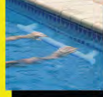
8. Wait 30 minutes, then... ENJOY!