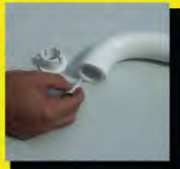
6. Apply adhesive to inside surface of Safety Exercise Bar.