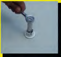
5. Firmly attach Mounting Caps w/ provided lag bolts and washers.