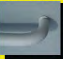
7. Tap Safety Exercise Bar onto mounting caps.