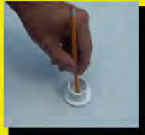
2. Use mounting cap to mark centers.