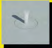
4. Clean hole and insert anchors.