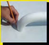
1. Mark post locations.